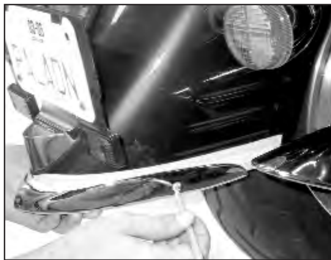
Figure 1. Tape Fender, Position Fender Tip, Mark Fender

Clean and polish with a chrome cleaner/polish. Check tightness of the nuts regularly.